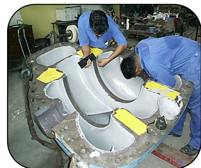
Split case pump rebuilt and protected using PES 201 Ceramic Repair Paste and PES 202 Ceramic Repair Fluid