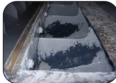
Process vessel surfaces badly corroded from chemical attack rebuilt using PES 201 Ceramic Repair Paste